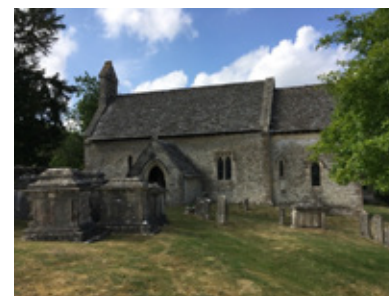
St. Michael's Church

The annual church service for supporters of the Society is an important tradition and has been held each year since our foundation. This year the service will be held at St. Michael's Church, Winson, GL7 5ER at 12.15pm on Sunday 17th September.